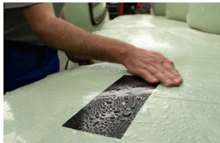
The robust product withstands 12 months outdoors