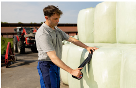
Application at low temperatures all year round

cover films is easy to apply even in cold weather and bonds immediately at temperatures above freezing. It is UV and water resistant for up to twelve months and can be torn by hand so that no further tools are needed. Our tape is based on halogen-free PE film in order to facilitate the recycling process of silage films after end of life, having been tested successfully in industrial recycling processes.