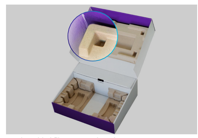
Bonds molded fiber to paperboard