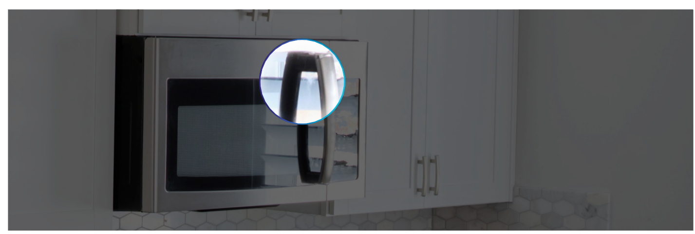
Bonds stainless steel to metal

Discover the power of our conformable double coated tissue tapes, which provide high-quality bonding and reworkability on many substrates. Exceptional clarity* and excellent performance in various environmental conditions, such as low temperature, make it an ideal choice for both interior and exterior bonding applications.