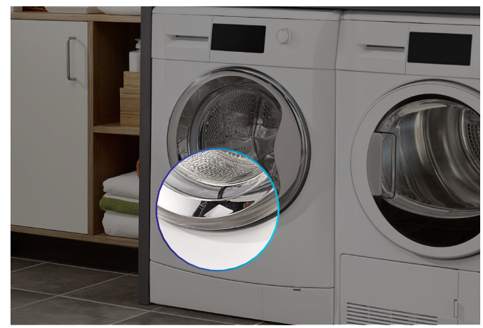
Bonds stainless steel to glass