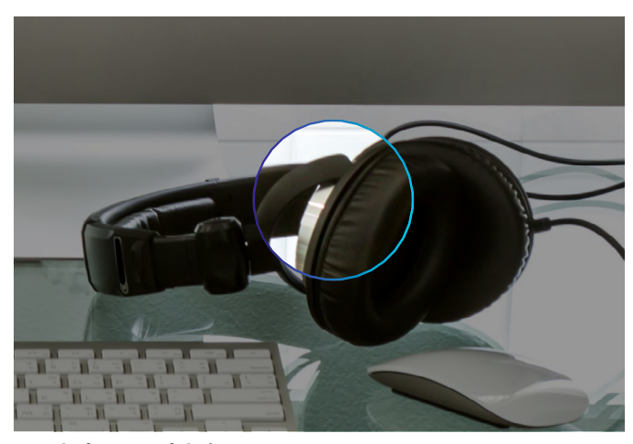
Bonds foam to fabric