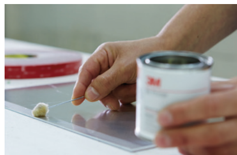
Quick dry time allows for immediate tape application.